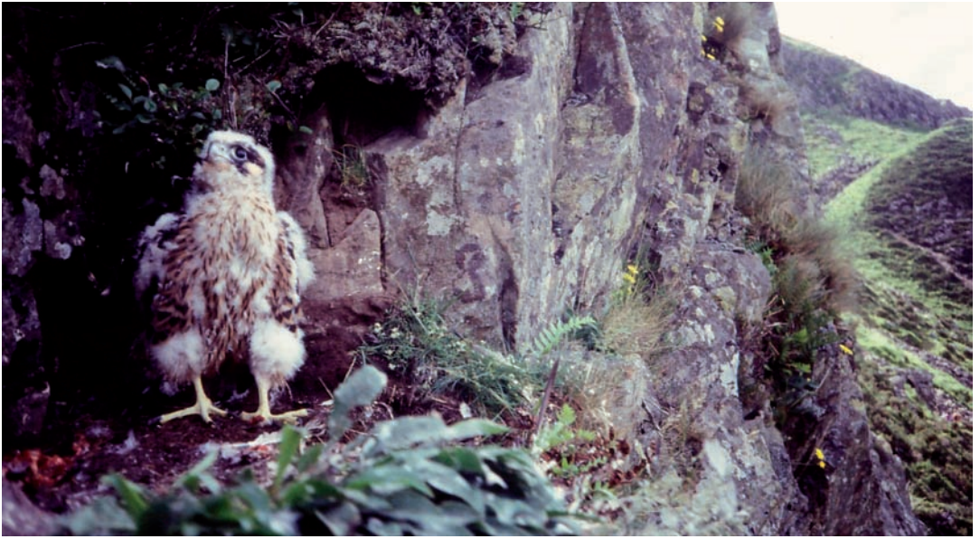
Above: Peregrine chick close to fledging