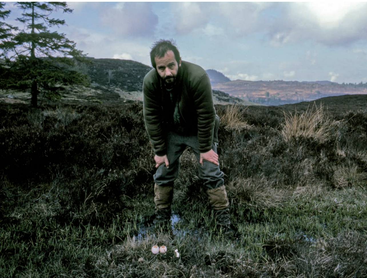
Below: Author with alphachloralose egg baits, 1988