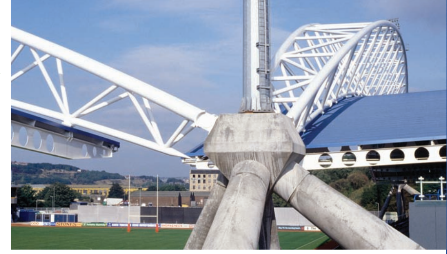
[Opposite] The twopin arched prismatic 'banana' truss of the McAlpine Stadium.